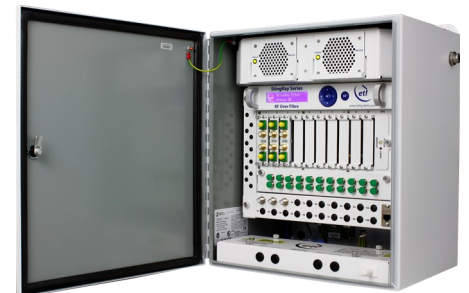
Outdoor Unit (ODU)

Indoor chassis showing hot-swap power supply modules, fibre modules and fans